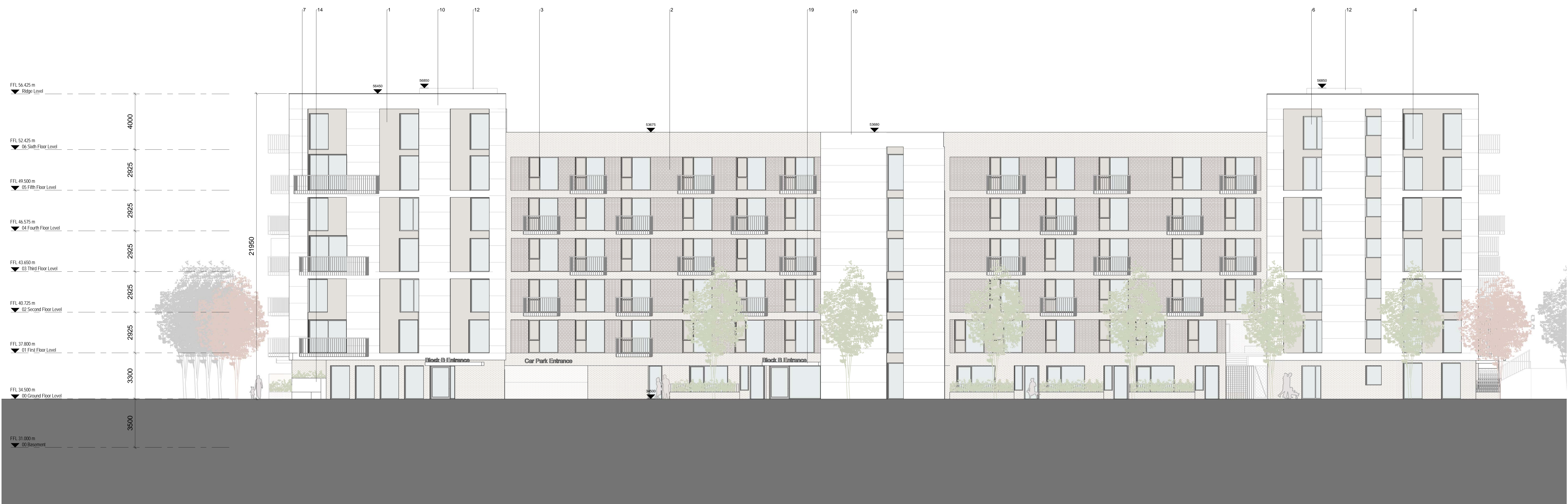
1 Elevation NE 1 : 100